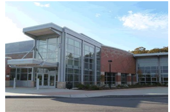
Winner of the 2004 Outstanding Design Award

EAST DOUGLAS, MA 01516 TELEPHONE 508-476-4100 FAX 508-476-7310